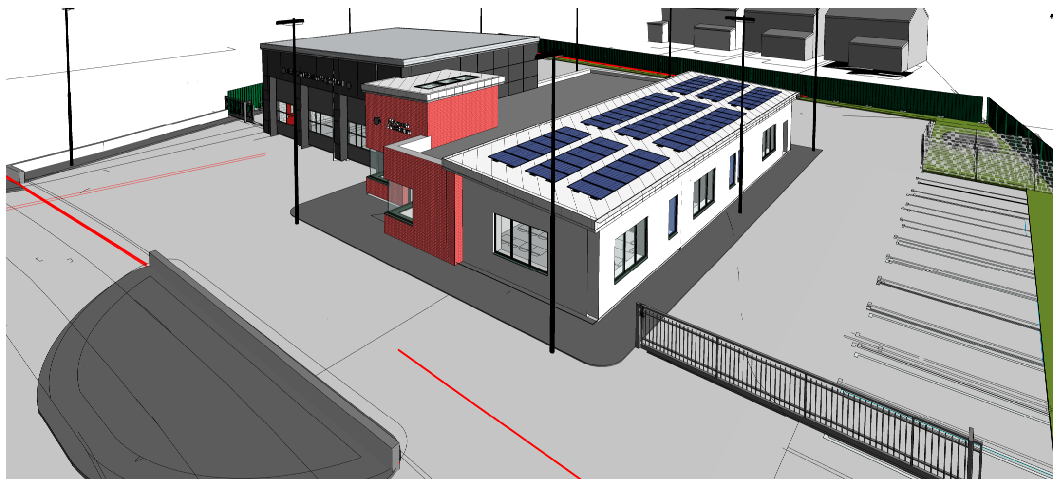
2 External View East