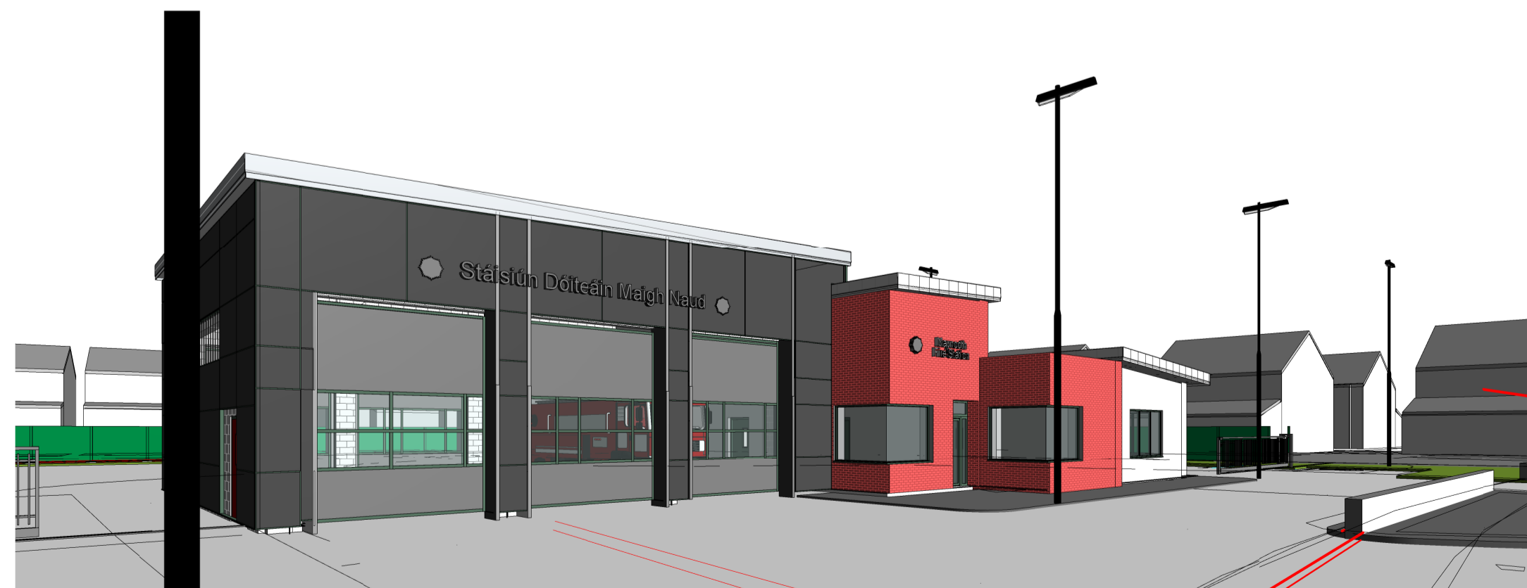
3 External View West